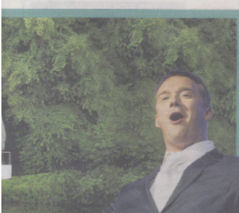
See Russell Watson at Brooklands — or, from left, jazz at Kenwood, opera at Aberglasney and theatre at Mount Grace Priory